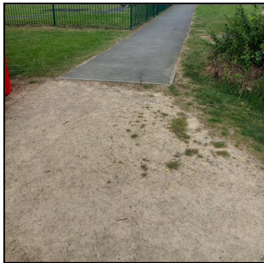
(Area where Breedon footpath meets footpath to Impey Close Playground)

The bottom of the slope leads to small Sculpture/obelisk where the path needs repair to.