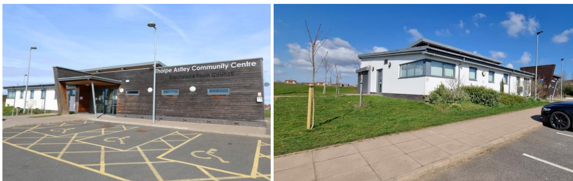
Figure 2 – Entrance to and side view of community centre

Space heating is delivered via underfloor heating throughout the building. A small air handler delivers tempered air to the changing rooms, WCs and doctors' surgery. Hot water demand extends to hand basins in the WCs, doctors' surgeries and kitchen sink. There are also 8 showers in the changing rooms and 1 shower in the disabled WC.