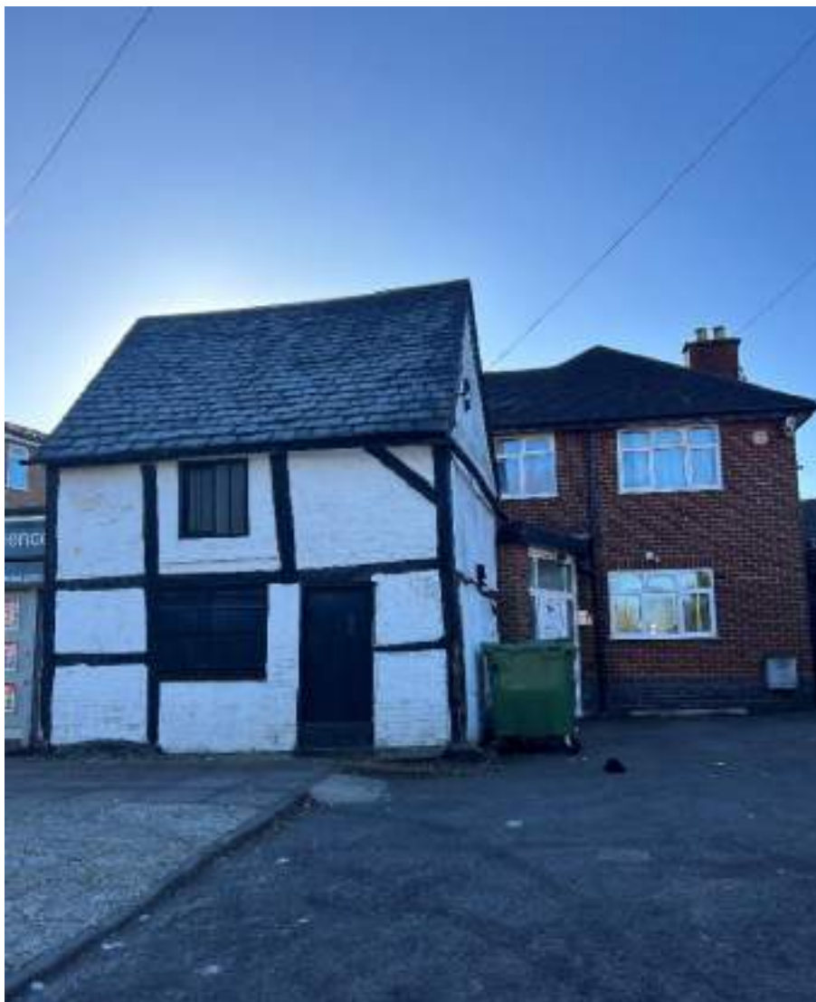
Image 11: Grade II Listed Former Shop with Storage Loft at 266 Braunstone Lane.

area is not as successful in retaining its former farmstead character.