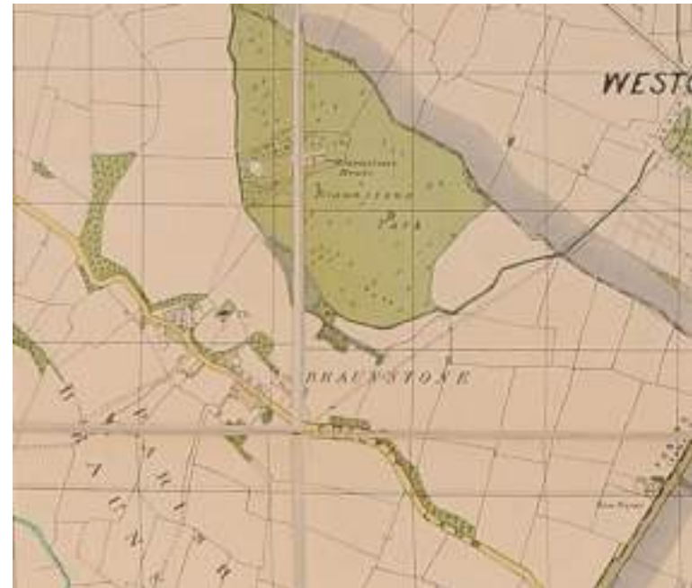
Image 3: Gibbons Map (1903) showing village in context with Braunstone Hall and Park.