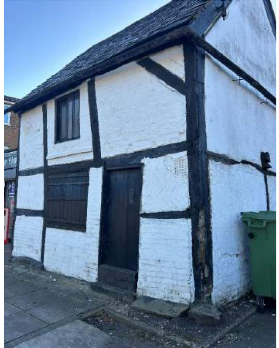
Image 19: Traditional materials dominate on the building with less cohesive floorscape materials below the plinth.