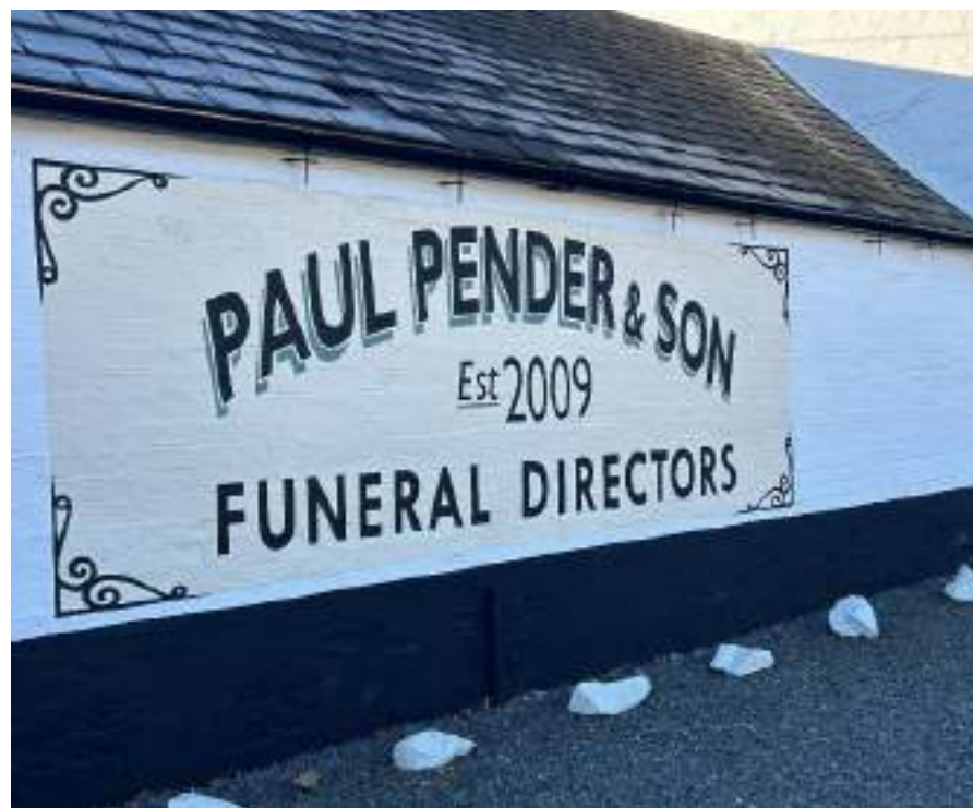
Image 14: Painted signage advertising Paul Pender & Sons Funeral Directors.

cohesive signage scheme which allows for the advertisement of the business while respecting the sensitive heritage setting. They have utilised a combination of contemporary and traditional painted techniques which balances well the needs of the business and the appearance of the building (Image 13). Notably, the former pub sign has been retained and sensitively amended, preserving this element of the building’s history.