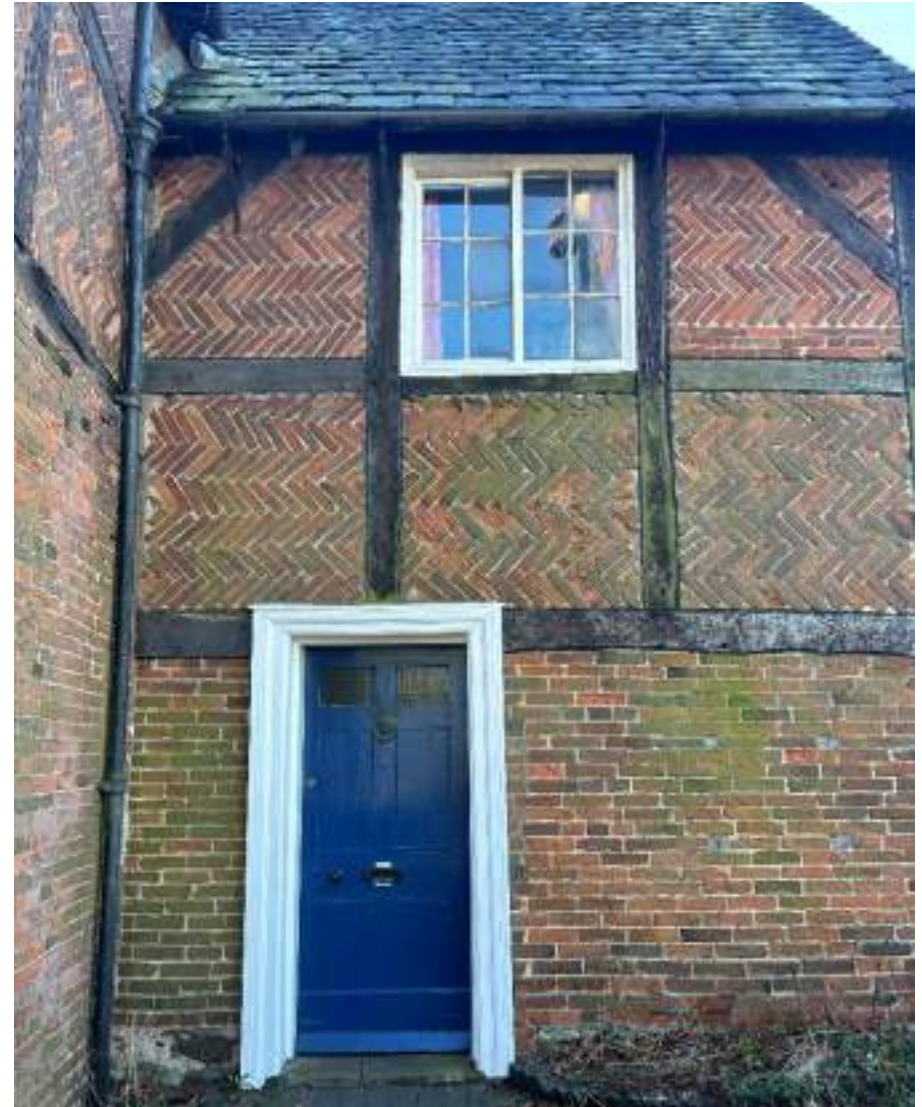
Image 15: The Manor, detail showing herringbone brick pattern, later inserted door and surround and vertical sliding sash window.