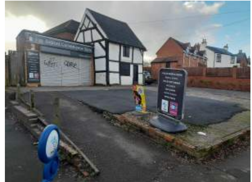
Images 23 & 24: Issues with boundary treatments and hard landscaping, as well as traffic on Braunstone Lane.