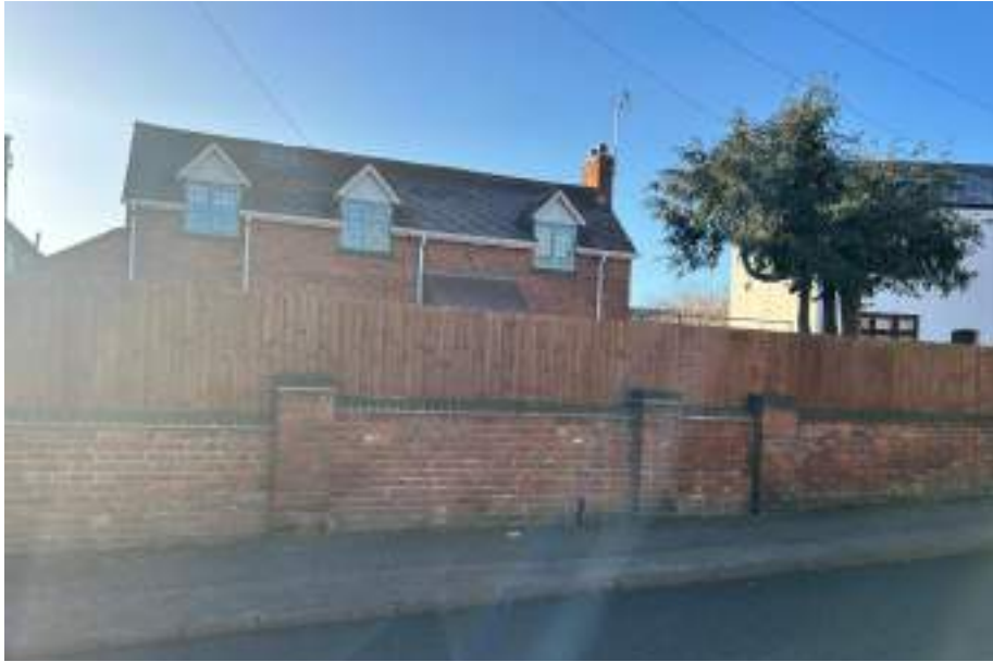
Image 17: Mixture of more and less traditional boundary treatments.