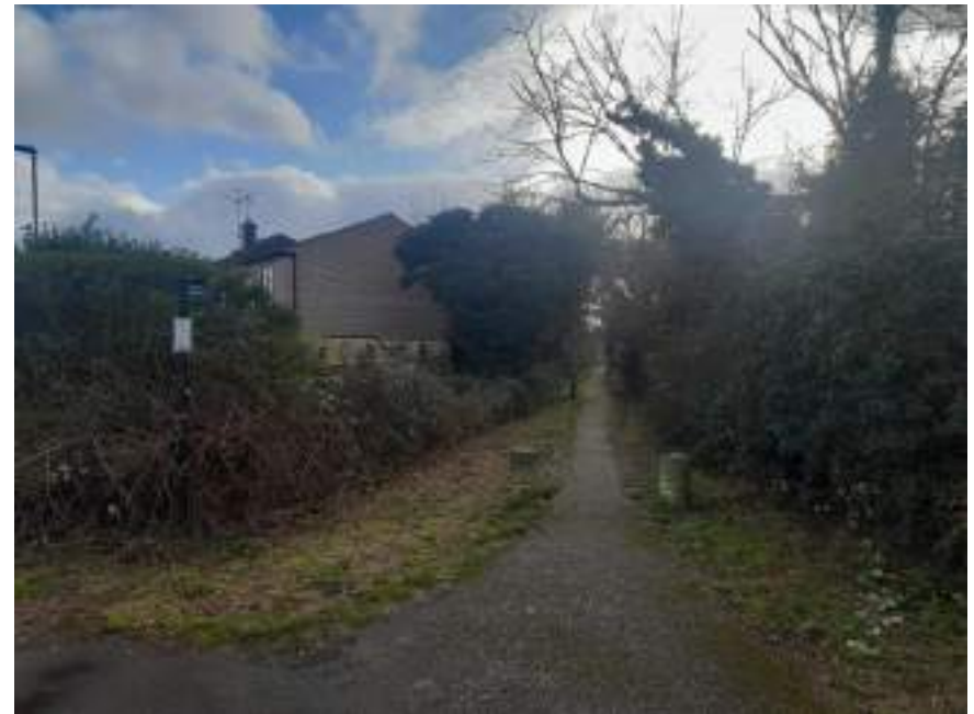
Image 22: View looking south from Avon Road down the public footpath below Shakespeare Park