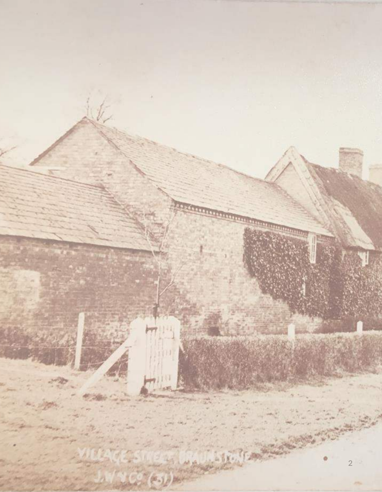
VILLAGE STREET, BRANLITON J.W. & CO. (31)