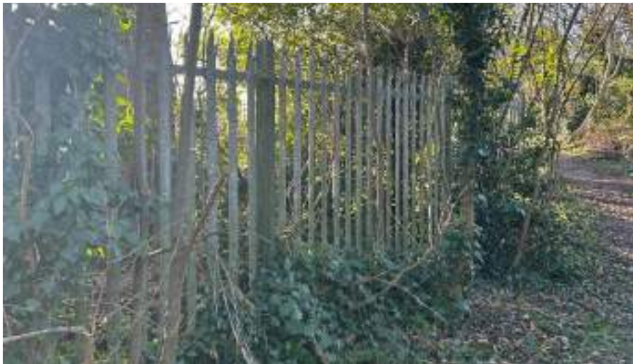
Image 18: More natural vegetation dominates along the public footpaths with more utilitarian fencing.