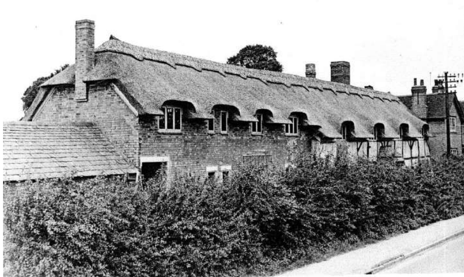
Photo 2 Ashleigh Farm 1953 A sympathetic upgrade to form Everard's Shakespeare Inn

From the late 19th Century and the following Century, it was known as Ashleigh Farm and continued to be known by that name after the Manorial Estate was acquired by Leicester Corporation in 1924/5.