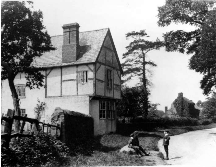
Photo 5 1890-1900 Manor Farm