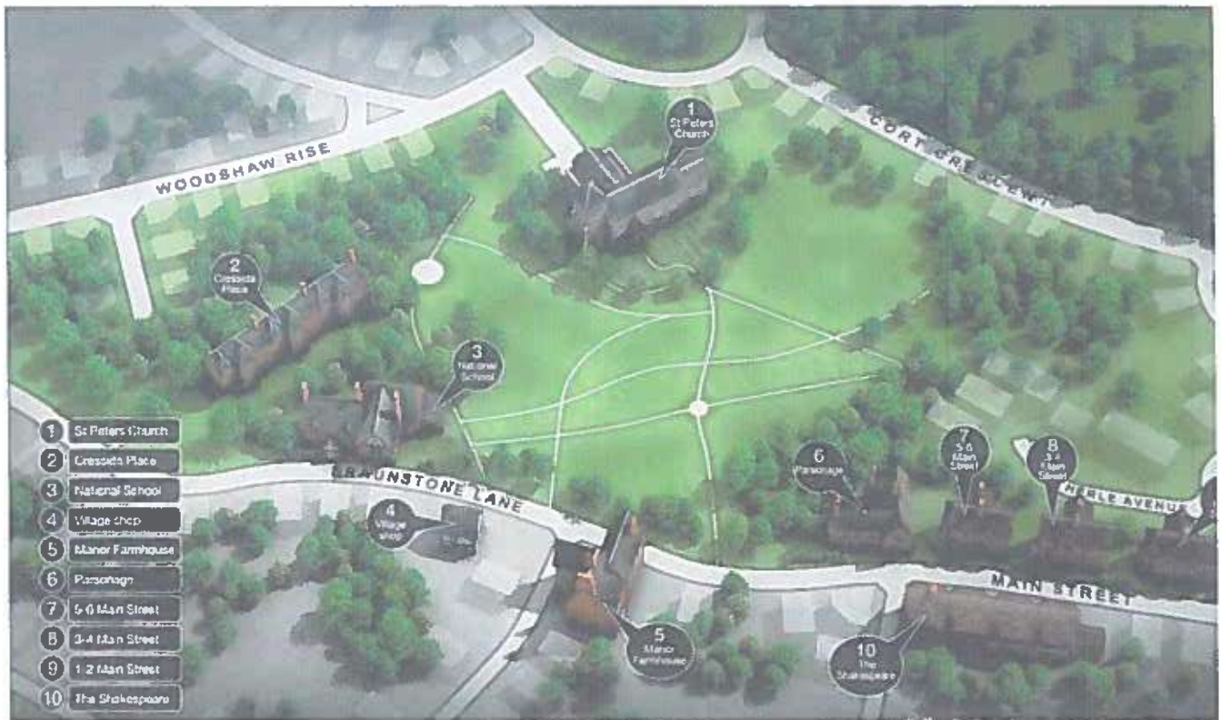
Photograph of Leicester City's Information Board on Main Street, 2021