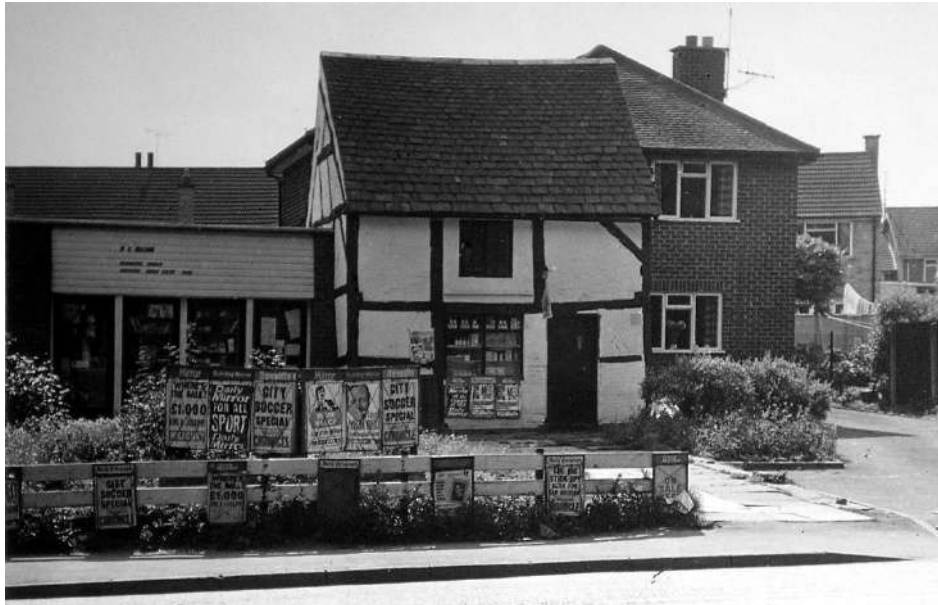
Photo 6 1974 view of the Village Shop now linked with the 1966 dwelling

As Braunstone Lane bends towards the northwest there are two more examples of 17th Century farm buildings in April Cottage and Holly Tree Cottage. To the southwest of April Cottage there is a dwelling which is known by the owner as the Cowsheds which could have been part of a farm complex. April Cottage and Holly Tree Cottage are not listed because they have both been modified on the external faces but do retain timber framing on the inside, similar in style and construction as Manor Farm.