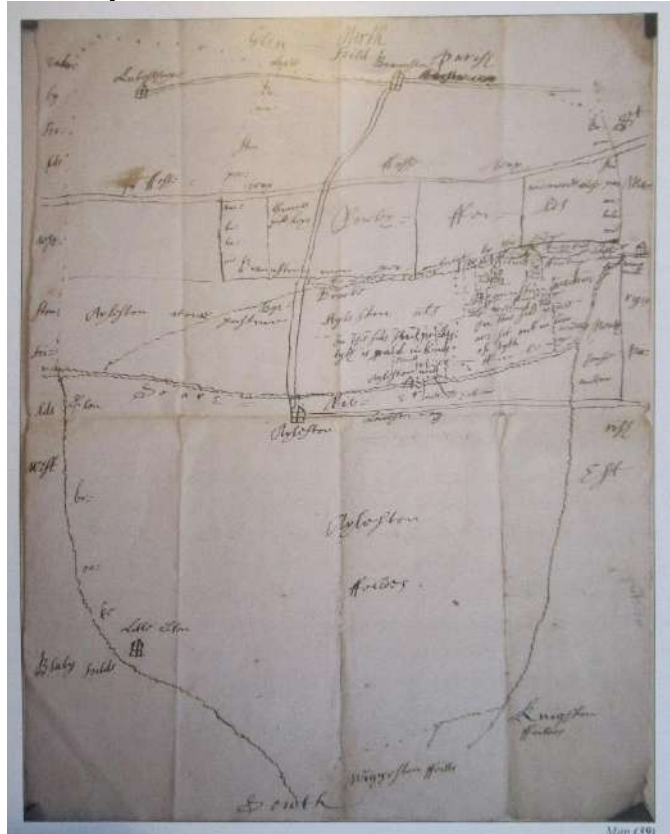
Photo 8 1682 Sketch Map. One of the oldest surviving map of Aylestone and Braunstone

A 1682 Sketch Map of Braunstone shows an ancient way connecting St Peter's Church to the Chapel at Lubbesthorpe. It was probably drawn up by the Parish Surveyor to define Parish Boundaries and includes the term 'perambulation', usually linked to Rogation Sunday events.