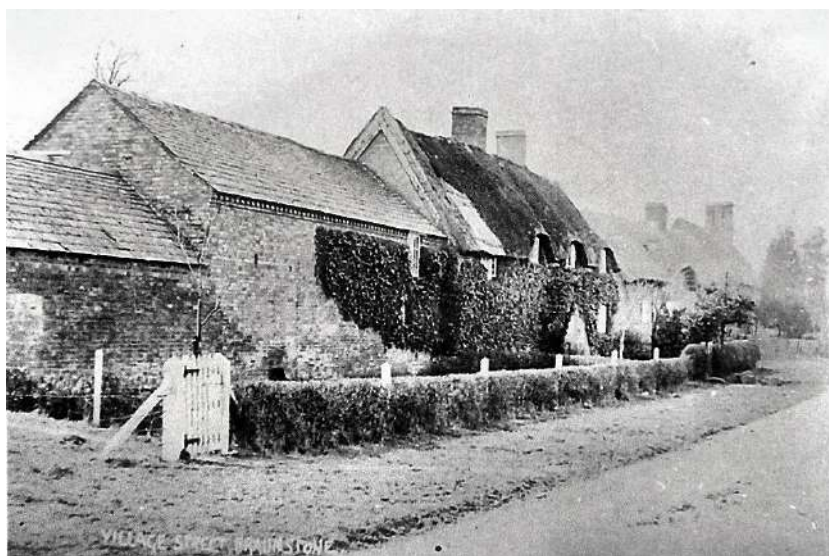
Photo 1 Ashleigh Farm Around 1900