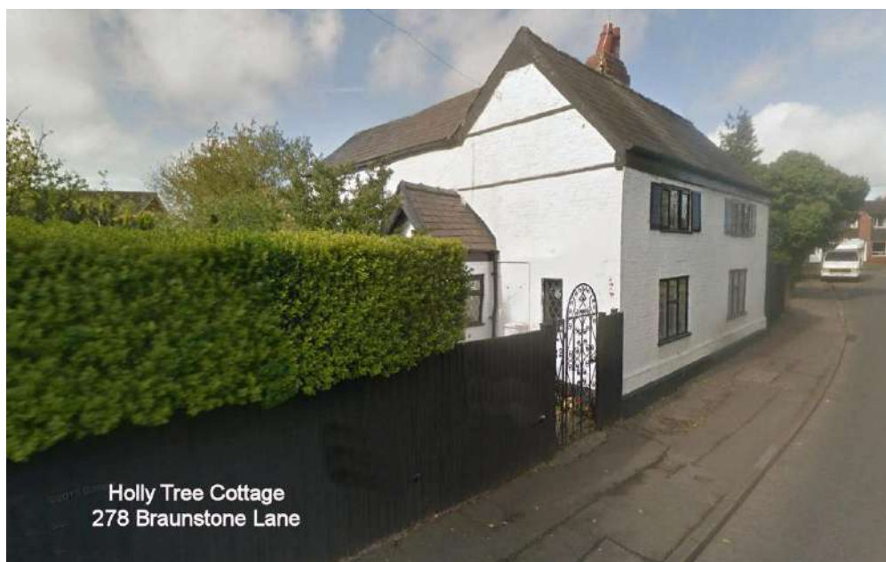
Photo 72017 April and Holy Tree Cottages