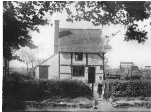
Village Shop Setting in