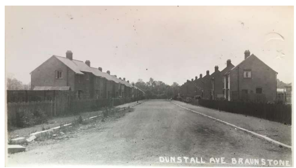
One of the modern residential estates built around Braunstone Village Conservation Area from the 1920's onwards.