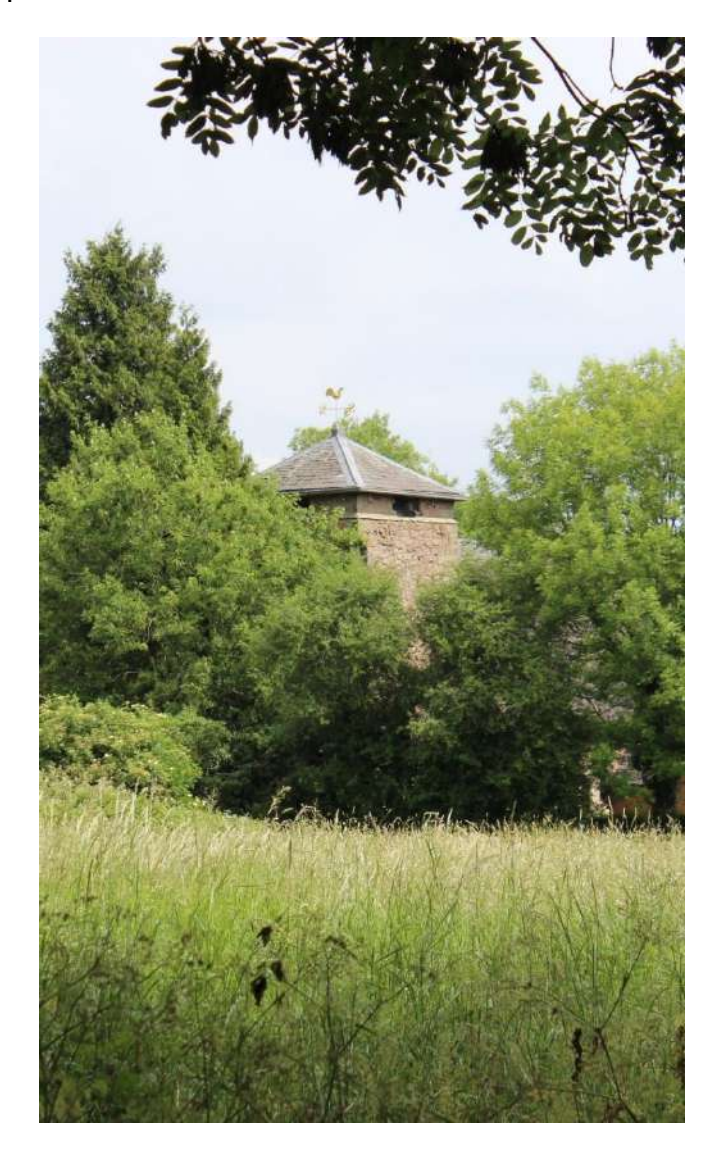
Left: St Mary's Church emerges in full view as approached from the north, the most prominent 'gateway' onto the Conservation Area.

Top: The west tower topped with the gilded weather vane emerges as prominent orientation point throughout the Conservation Area, emerging from beyond the tree cover.