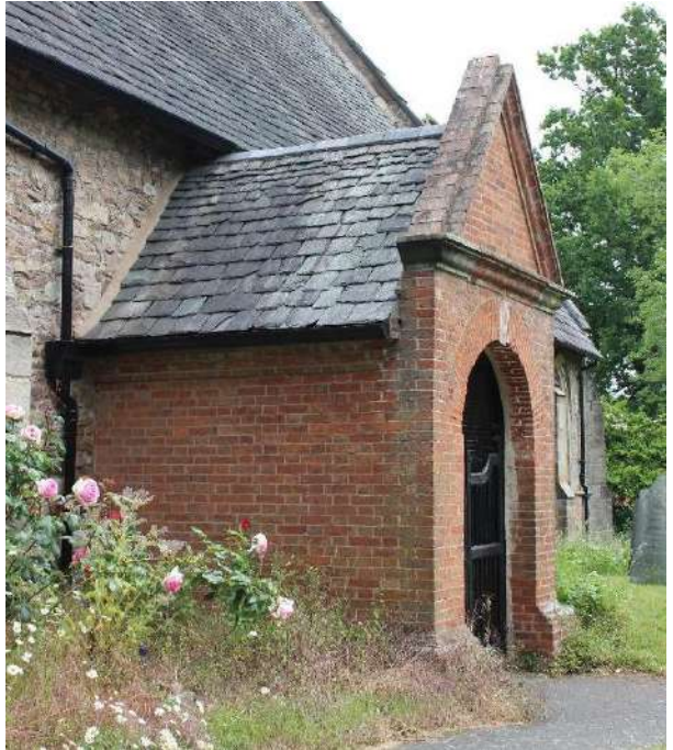
Top: The south elevation of the church, with the main body of the nave, 13<sup>th</sup> century west tower and Swithland slate roofs.

Left: A brick porch, most likely early 18<sup>th</sup> century in date.