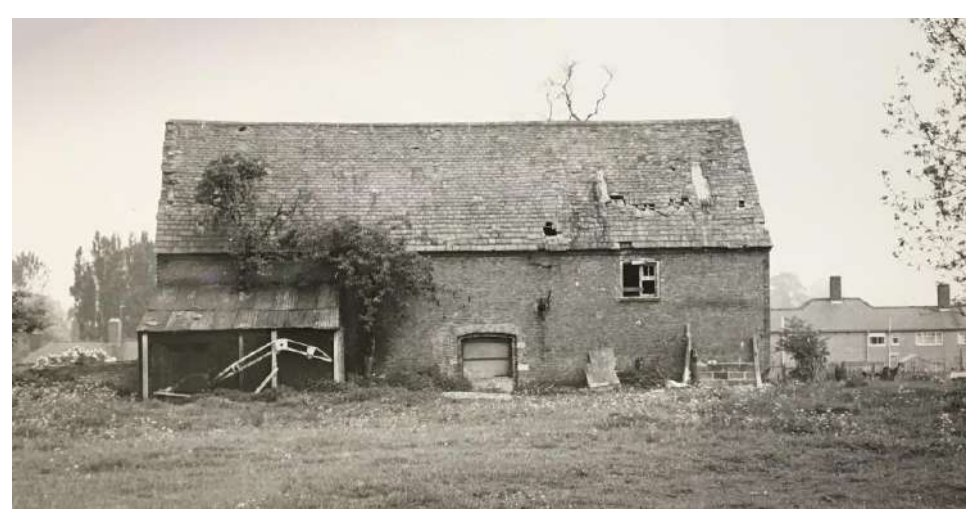
First 'Old' Hall Farm was built in 1600 and demolished in the 1770's, when the new Old Hall Farm was constructed; this was demolished in 1967 to make way for the new residential estate.

The critical turning point for the whole of Braunstone came, when Leicester Corporation purchased the bulk of the Braunstone Hall estate in 1925, to provide for expanded housing provisions in the area. A major housing estate was built immediately north of Braunstone Conservation Area, with further construction south of Braunstone Lane. As a result, the local population grew dramatically from 238 in 1921 to nearly 7,000 in 1931. Braunstone Hall was vacated in 1926 and on 29th of August 1932 it opened as Hall Junior School, after the National School at 8 Braunstone Lane closed as an educational facility two years prior.