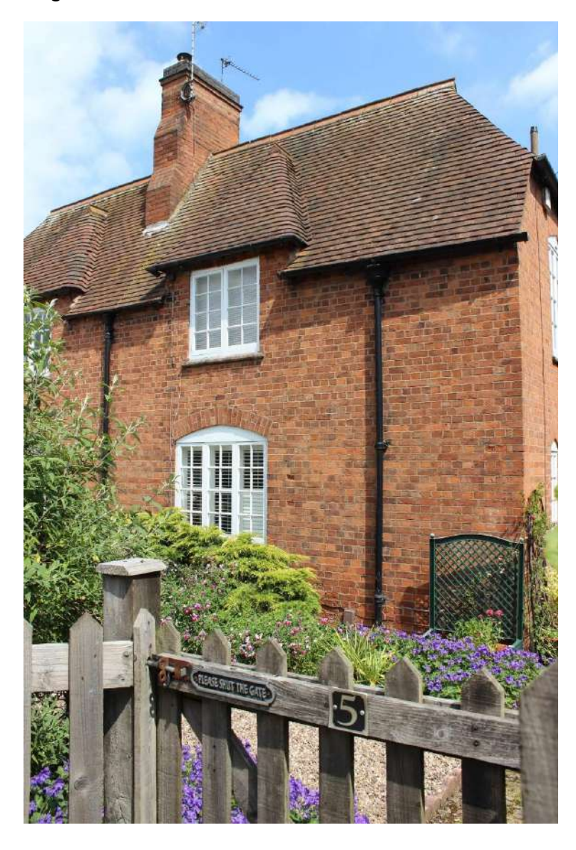
The pair of cottages at 5-6 Main Street is the most architecturally plain of all, but nonetheless of much visual interest and architectural merit.

Despite varying elevation treatments, the dwellings at 1-6 Main Street are constructed from red brick, with pitched clay tile roofs and timber casement.